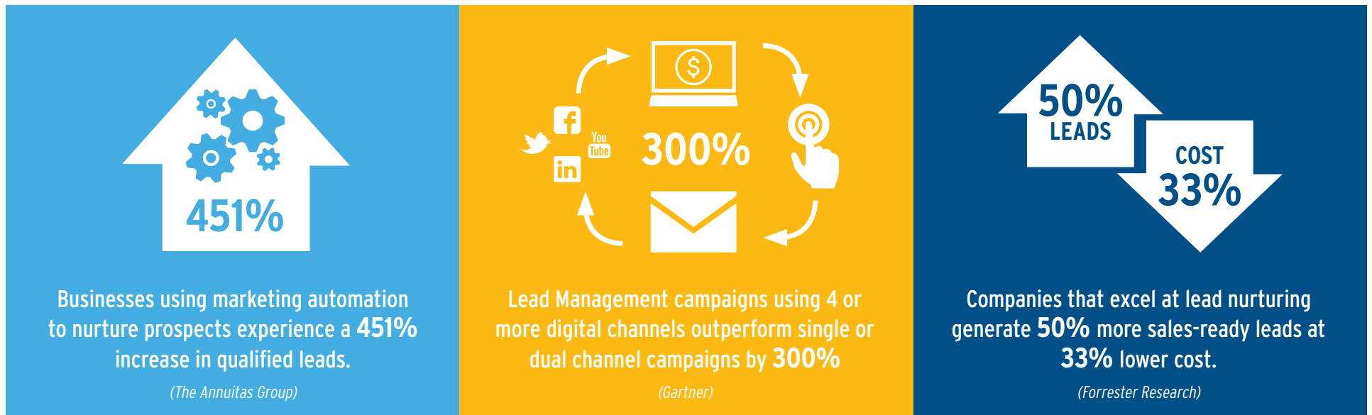
Figure 3: Importance of Using Multiple Tactics as Part of Your Marketing and Nurturing Efforts.

with their leads by automating as much of the marketing process as possible. This includes providing an integrated marketing platform that allows for coordination of what you deliver to a prospect with what the partner is delivering to the prospect. Make it as easy as possible for partners to educate their customers and prospects, and in the end, you will both benefit.